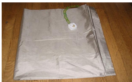
From PC size through to Super King