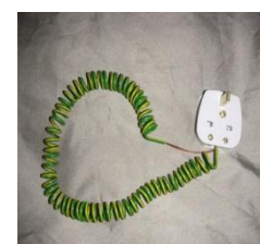
Earthing cable & plug